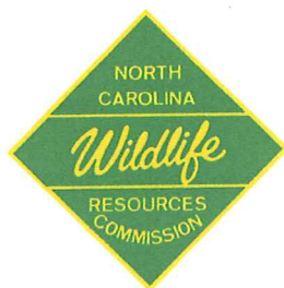
EXHIBIT A July 11, 2013